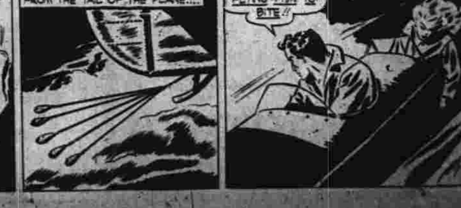
THE FLOWING TIE